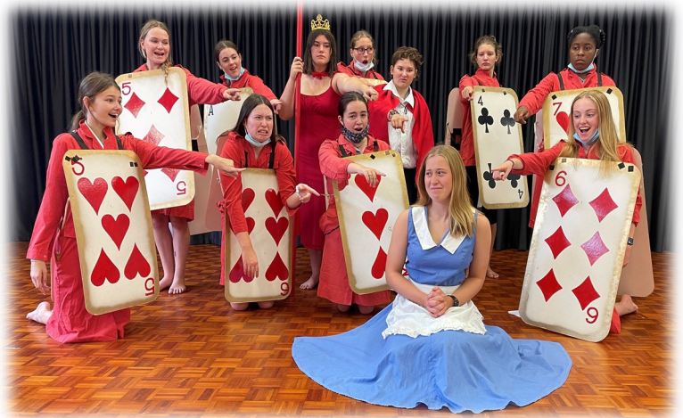
It IS Alice!

The Year 11 Drama class have been working hard whilst having many laughs as we prepare for our performance of The Adventures of Alice . We are planning to take this to the stage at Fitzroy Primary soon when the covid-complications of life lessen. The script consists of four scenes amalgamated from the basic stories of "Alice in Wonderland", "Through the Looking Glass" and a little influence from the Tim Burton film. We meet Alice in the pool of tears of scene 1 where the conflict is introduced. A good children's play always needs the baddie and it is, of course, the Red Queen. We find out more about her mad world in the croquet party of scene 2. Tension builds as we meet the banished White Queen who should be rightly ruling the land. She is protected by her trusted army of flowers and all this is shown in scene 3. Finally, the necessary conflict erupts in scene 4 where Alice dares to challenge the Red Queen in the famous court case of who-stole-the-tarts! We look forward to sharing more photos of the action in future newsletters!