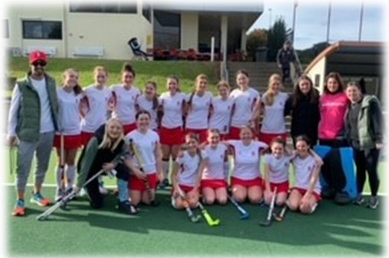
Te Toa Hockey Team