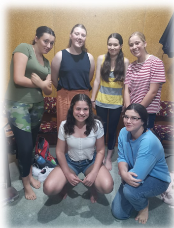
Midsummer Nights Dream