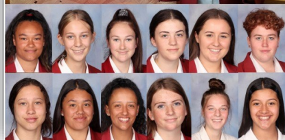
Excellence in Pathways students