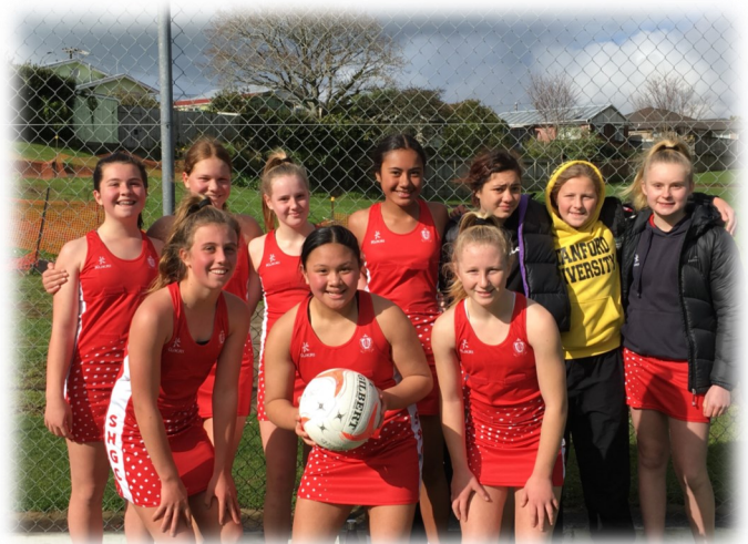
8A Netball Team

Well done to the girls who also managed to win some games in table tennis, chess and indoor bowls.