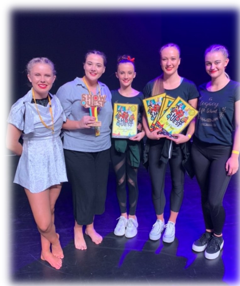
Show Quest leaders