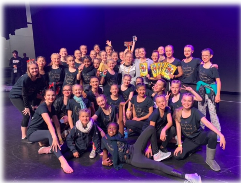
Show Quest crew