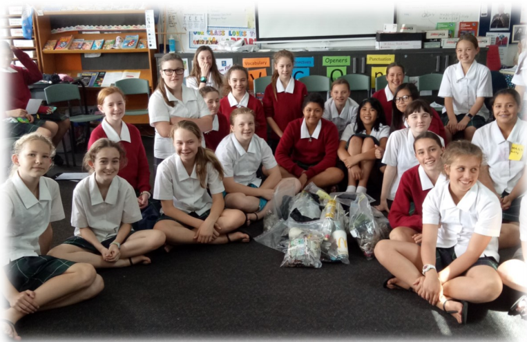
Enviro group's litter collection

Photos below show Sacred Heart's efforts to enhance biodiversity within the Restore Strandon Project to become predator free.