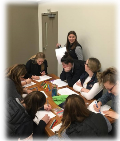
Year 13 Retreat